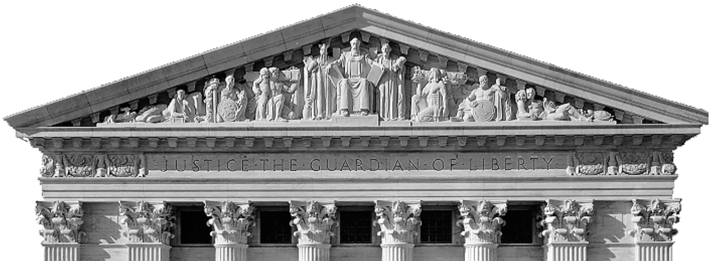
The East Pediment by Hermon A. MacNeil

Law as an element of civilization was normally and naturally derived or inherited in this country from former civilizations. The "Eastern Pediment" of the Supreme Court Building suggests therefore the treatment of such fundamental laws and precepts as are derived from the East. Moses, Confucius and Solon are chosen as representing three great civilizations and form the central group of this Pediment. Flanking this central group - left - is the symbolical figure bearing the means of enforcing the law. On the right a group tempering justice with mercy, allegorically treated. The "Youth" is brought into both these groups to suggest the "Carrying on" of civilization through the knowledge imbibed of right and wrong. The next two figures with shields; Left - The settlement of disputes between states through enlightened judgment. Right - Maritime and other large functions of the Supreme Court in protection of the United States. The last figures: Left - Study and pondering of judgments. Right - A tribute to the fundamental and supreme character of this Court. Finale - The fable of the Tortoise and the Hare.