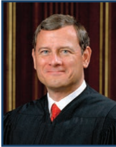
Chief Justice Roberts