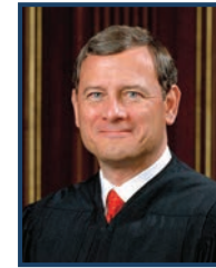
Chief Justice Roberts