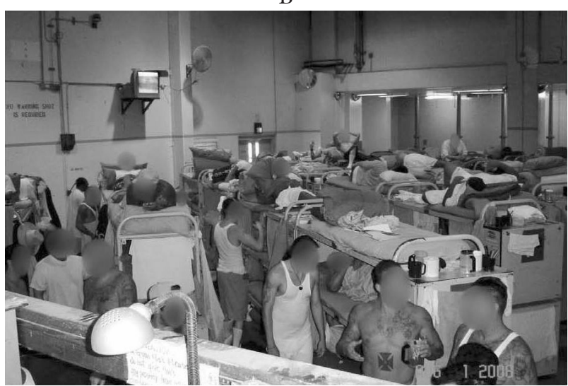
Mule Creek State Prison Aug. 1, 2008