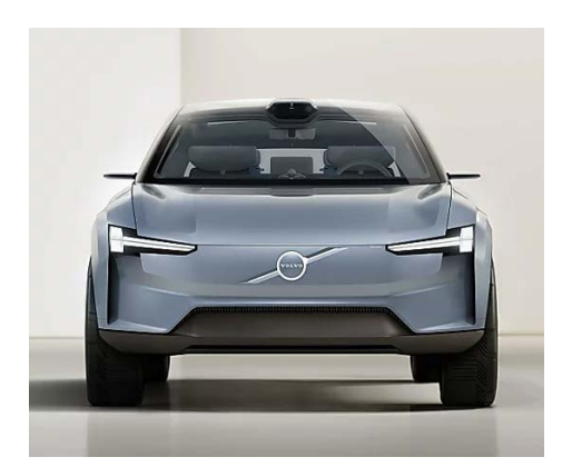
The new Volvo EX90 (Take a look at the prices) Sponsored | Volvo EX90 | Search Ads