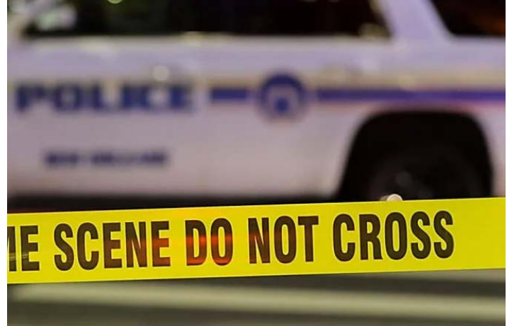
18-year-old shot and killed on Canal Street Saturday night; suspect arrested