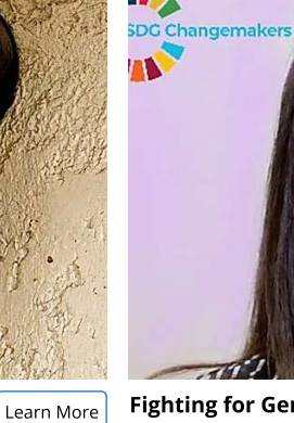
Fighting for Gender Equality