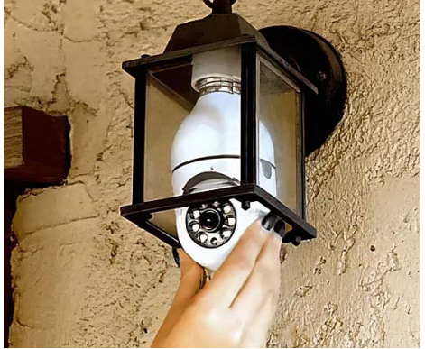
New Camera Makes Doorbell Cams Obsolete