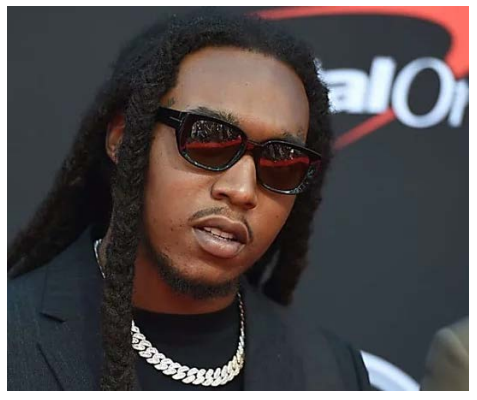
Attention Turns to The | Prince Family & Houston's Mob Ties Crew in Death of Takeoff from Migos