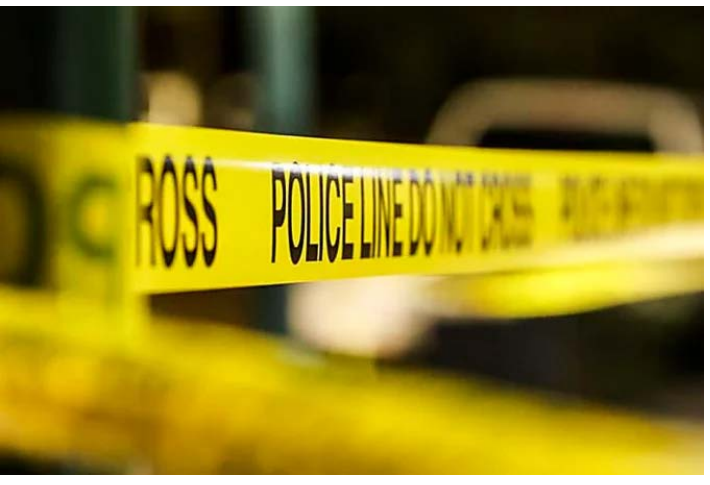
5 people injured in Bourbon Street shooting, police say