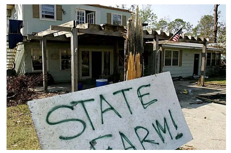
Once dominated by behemoths, Louisiana insurance increasingly provided by unproven carriers

With classic cateye design, these stylish glasses are made... Sponsored | Zeelool