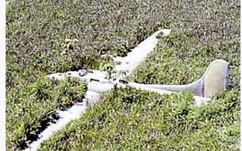
Found After 68 Years In The Jungle, But When They Look Inside