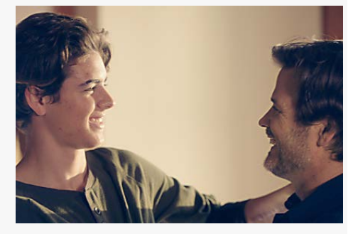
Go Ask Dad Today, and Every Day Gillette on Mashable