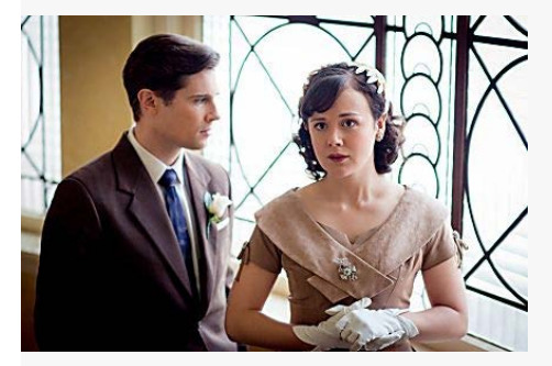
If You Loved Downton Abbey Amazon.com