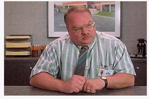
13 Most Useless Job Skills Employers Don't Want Anymore