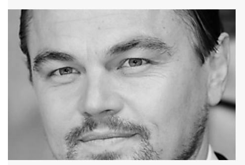
The Inside Of Leonardo Dicaprio's House Is Far From What You'd Expect