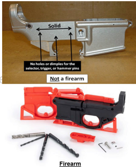
Figure 1. See Dept. of Justice, ATF, Open Letter to All Federal Firearms Licensees 3, 6 (Sept. 27, 2022), https://www.atf.gov/firearms/docs/open-letter/all-fpls-september-2022-impact-final-rule-2021-05f-partially-complete-ar/download .

jects as frames or receivers based on criteria other than the object's physical characteristics. Under the Rule, any "tools, instructions, guides, or marketing materials" that are "made available by the seller" can convert an unregulated piece of metal into a regulated "frame or receiver." 27 CFR § 478.12(c). Put another way, the mere presence of things distinct from the object at issue can somehow transform the character of the object itself.