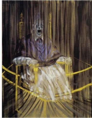
Francis Bacon, Study After Velázquez's Portrait of Pope Innocent X, 1953, oil on canvas