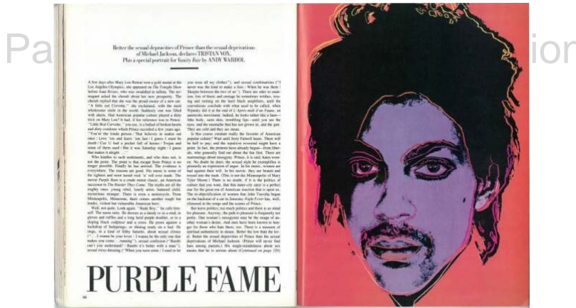
Figure 2. A purple silkscreen portrait of Prince created in 1984 by Andy Warhol to illustrate an article in Vanity Fair .

In addition to the single illustration authorized by the Vanity Fair license, Warhol created 15 other works based on Goldsmith’s photograph: 13 silkscreen prints and two pencil drawings. The works are collectively referred to as the “Prince Series.” See Appendix, infra . Goldsmith did not know about the Prince Series until 2016, when she saw the image of an orange silkscreen portrait of Prince (“Orange