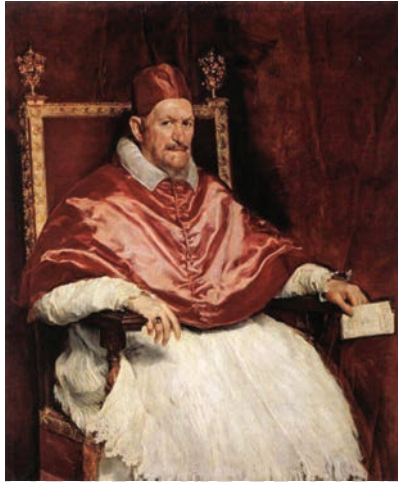
Velázquez, Pope Innocent X, c. 1650, oil on canvas

appropriative traditions. On the left (below) is Velázquez's portrait of Pope Innocent X; on the right is Francis Bacon's Study After Velázquez's Portrait.