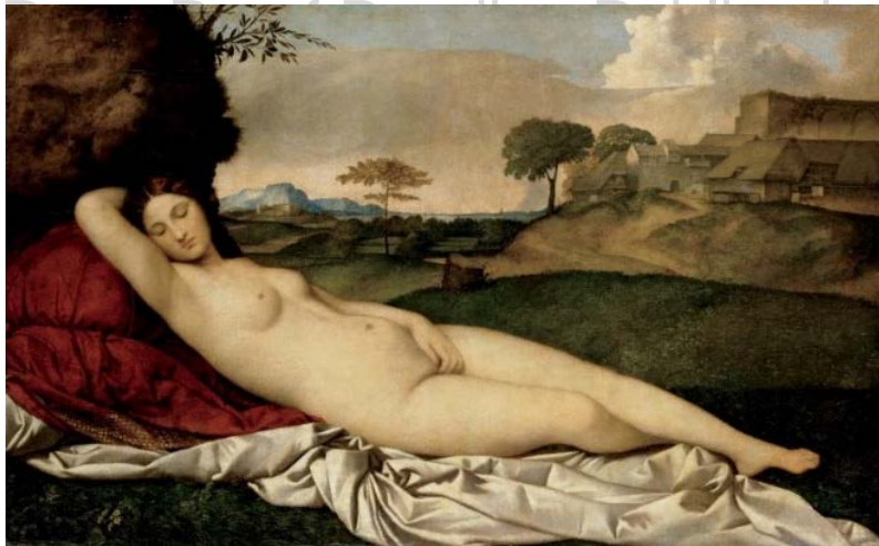
Giorgione, Sleeping Venus , c. 1510, oil on canvas

Consider as one example the reclining nude. Probably the first such figure in Renaissance art was Giorgione’s Sleeping Venus . (Note, though, in keeping with the “nothing comes from nothing” theme, that Giorgione apparently modeled his canvas on a woodcut illustration by Francesco Colonna.) Here is Giorgione’s painting: