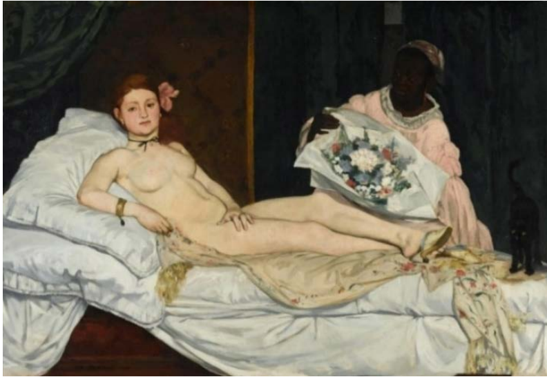
Manet, Olympia, 1863, oil on canvas

Here again consider the account of the Rauschenberg, Lichtenstein, and Mitchell Foundations: “The revolutionary shock of the painting depends on how traditional imagery remains the painting’s recognizable foundation, even as that imagery is transformed and wrenched into the present.” Brief as Amici Curiae 9. It is an especially striking example of a recurrent phenomenon—of how the development of visual art works across time and place, constantly building on what came earlier. In fact, the Manet has itself spawned further transformative paintings, from Cézanne to a raft of contemporary artists across the globe. See id. , at 10–11. But the majority, as to these matters, is uninterested and unconcerned.