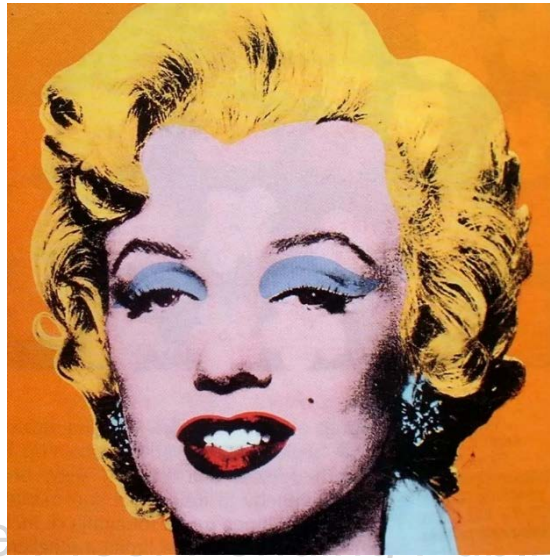
Andy Warhol, Marilyn, 1964, acrylic and silkscreen ink on linen

166. The result—see for yourself—is miles away from a literal copy of the publicity photo.