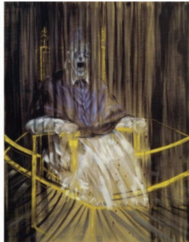
Francis Bacon, Study After Velázquez's Portrait of Pope Innocent X, 1953, oil on canvas