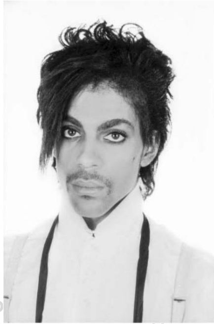
Figure 1. A black and white portrait photograph of Prince taken in 1981 by Lynn Goldsmith.

license were that the illustration was “to be published in Vanity Fair November 1984 issue. It can appear one time full page and one time under one quarter page. No other usage right granted.” Ibid. Goldsmith was to receive $400 and a source credit.