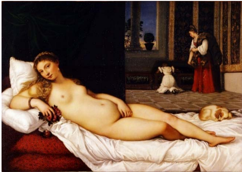
Titian, Venus of Urbino , 1538, oil on canvas

prototypical example of Renaissance imitatio —the creation of an original work from an existing model. See id. , at 8; 1 G. Vasari, Lives of the Artists 31, 444 (G. Bull transl. 1965). You can see the resemblance—but also the difference: