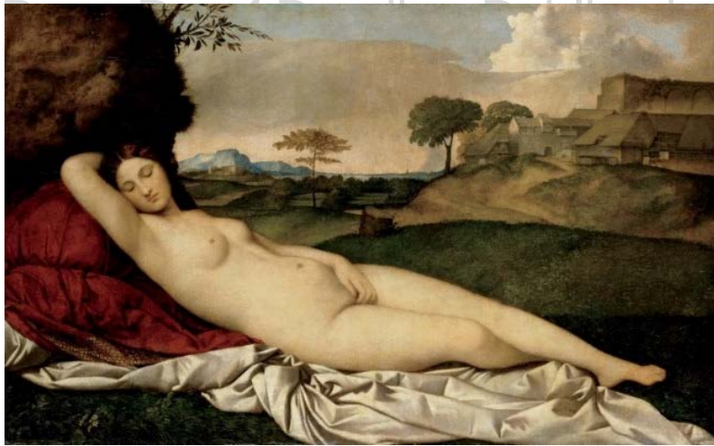
Giorgione, Sleeping Venus , c. 1510, oil on canvas

Consider as one example the reclining nude. Probably the first such figure in Renaissance art was Giorgione’s Sleeping Venus . (Note, though, in keeping with the “nothing comes from nothing” theme, that Giorgione apparently modeled his canvas on a woodcut illustration by Francesco Colonna.) Here is Giorgione’s painting: