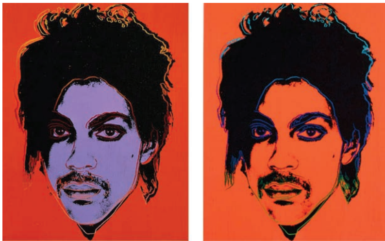
Andy Warhol, Prince, 1984, synthetic paint and silkscreen ink on canvas

ently colored, out-of-kilter lines around Prince's face and hair (a bit hard to see in the reproduction below—more pronounced in the original). Altogether, Warhol made 14 prints and two drawings—the Prince series—in a range of unnatural, lurid hues. See Appendix, ante , at 552. Vanity Fair chose the Purple Prince to accompany an article on the musician. Thirty-two years later, just after Prince died, Condé Nast paid Warhol (now actually his foundation, see supra , at 558, n. 1) to use the Orange Prince on the cover of a special commemorative magazine. A picture (or two), as the saying goes, is worth a thousand words, so here is what those magazines published: