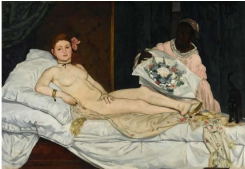
Manet, Olympia, 1863, oil on canvas

Here again consider the account of the Rauschenberg, Lichtenstein, and Mitchell Foundations: “The revolutionary shock of the painting depends on how traditional imagery remains the painting’s recognizable foundation, even as that imagery is transformed and wrenched into the present.” Brief as Amici Curiae 9. It is an especially striking example of a recurrent phenomenon—of how the development of visual art works across time and place, constantly building on what came earlier. In fact, the Manet has itself spawned further transformative paintings, from Cézanne to a raft of contemporary artists across the globe. See id. , at 10–11. But the majority, as to these matters, is uninterested and unconcerned.