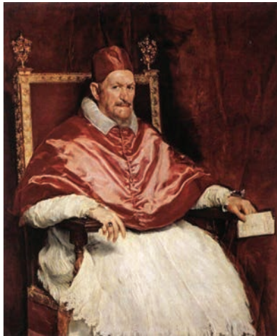
Velázquez, Pope Innocent X, c. 1650, oil on canvas

appropriative traditions. On the left (below) is Velázquez's portrait of Pope Innocent X; on the right is Francis Bacon's Study After Velázquez's Portrait.