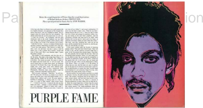
Figure 2. A purple silkscreen portrait of Prince created in 1984 by Andy Warhol to illustrate an article in Vanity Fair .

In addition to the single illustration authorized by the Vanity Fair license, Warhol created 15 other works based on Goldsmith’s photograph: 13 silkscreen prints and two pencil drawings. The works are collectively referred to as the “Prince Series.” See Appendix, infra . Goldsmith did not know about the Prince Series until 2016, when she saw the image of an orange silkscreen portrait of Prince (“Orange