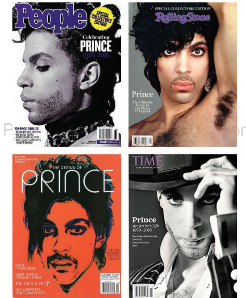
Figure 5. Four special edition magazines commemorating Prince after he died in 2016.

Stone and Time, also released special editions. See fig. 5, infra . All of them depicted Prince on the cover. All of them used a copyrighted photograph in service of that object. And all of them (except Condé Nast) credited the photographer.