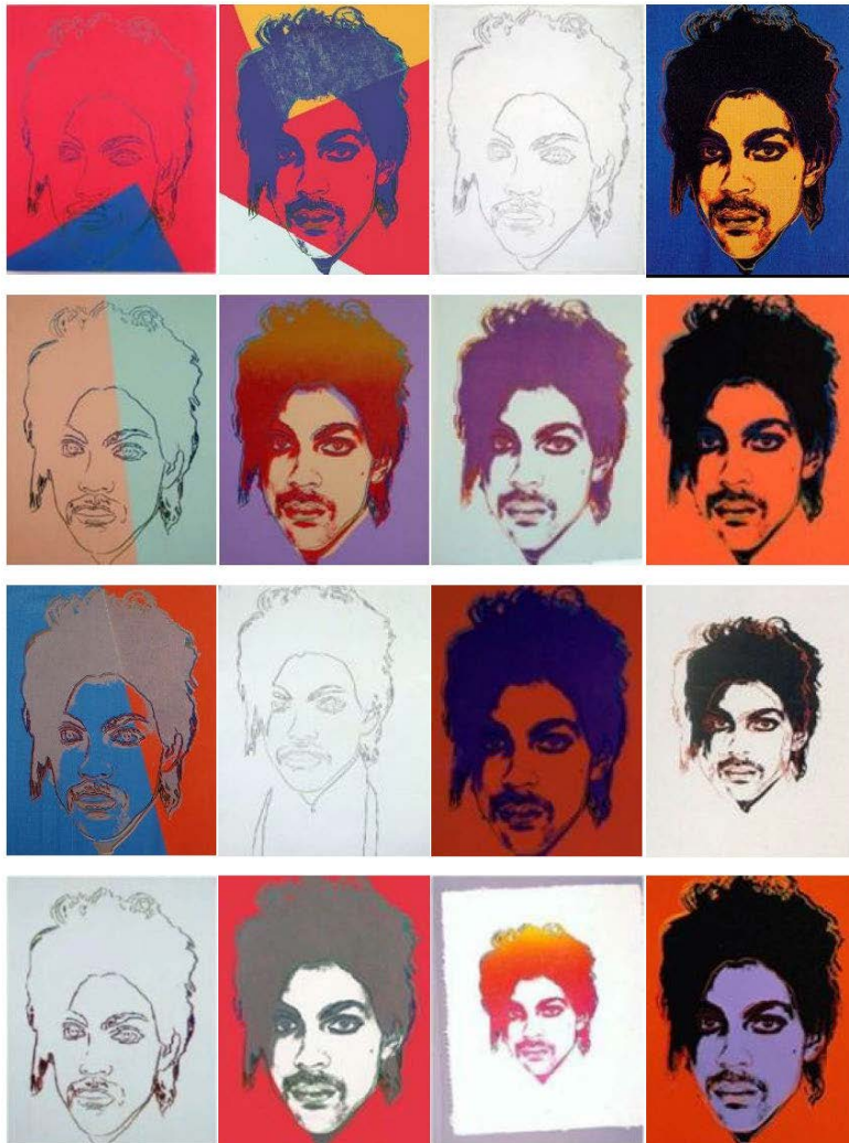
Andy Warhol created 16 works based on Lynn Goldsmith's photograph: 14 silkscreen prints and two pencil drawings. The works are collectively known as the Prince Series.