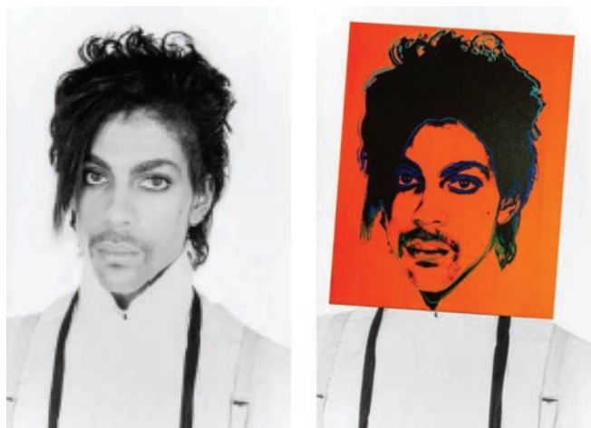
Figure 6. Warhol’s orange silkscreen portrait of Prince superimposed on Goldsmith’s portrait photograph.

The District Court granted summary judgment for AWF. 382 F. Supp. 3d 312, 316 (SDNY 2019). The court considered the four fair use factors enumerated in 17 U.S.C. § 107 and held that the Prince Series works made fair use of Goldsmith’s photograph. As to the first factor, the works were “transformative” because, looking at them and the photograph “side-by-side,” they “have a different character, give Goldsmith’s photograph a new expression, and employ new aesthetics with creative and communicative results distinct from Goldsmith’s.” 382 F. Supp. 3d, at 325–326 (internal