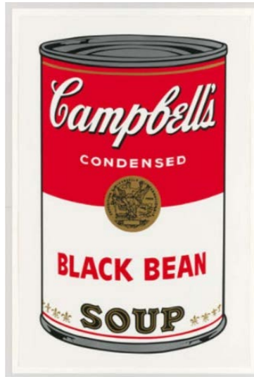
Figure 7. A print based on the Campbell's soup can, one of Warhol's works that replicates a copyrighted advertising logo.

Yet not all of Warhol's works, nor all uses of them, give rise to the same fair use analysis. In fact, Soup Cans well illustrates the distinction drawn here. The purpose of Campbell's logo is to advertise soup. Warhol's canvases do not share that purpose. Rather, the Soup Cans series uses Campbell's copyrighted work for an artistic commentary on consumerism, a purpose that is orthogonal to advertising soup. The use therefore does not supersede the objects of the advertising logo. 15