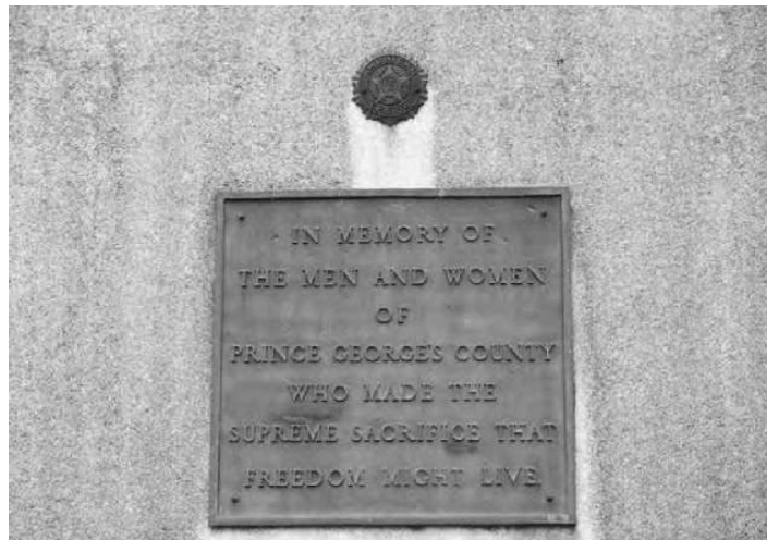
Plaque of the World War II Memorial. App. 891.