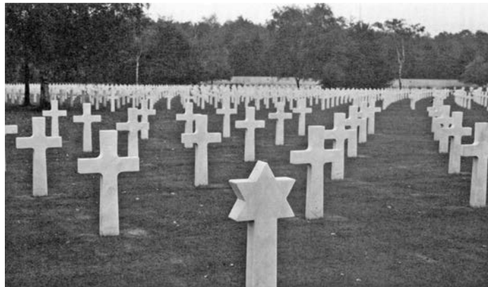
Headstones in the Henri-Chappelle American Cemetery and Memorial in Belgium. American Battle Monuments Commission, Henri-Chappelle American Cemetery and Memorial 16 (1986).