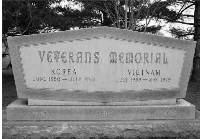
The Korea-Vietnam Veterans Memorial in Veterans Memorial Park. App. 894.