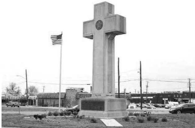
The Bladensburg Peace Cross. App. 887.