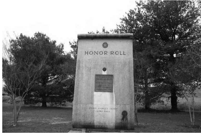
The World War II Memorial in Veterans Memorial Park. App. 891.