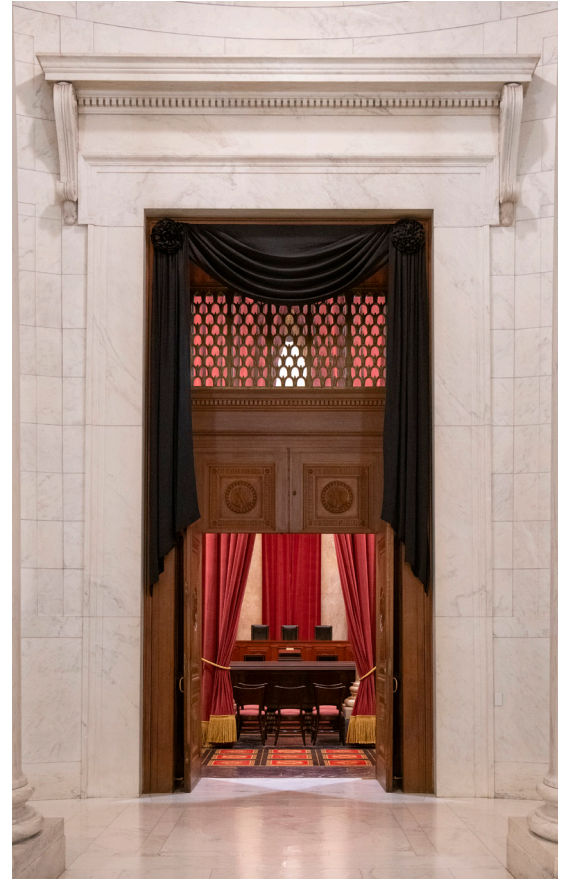
The Courtroom doors draped for Retired Justice Sandra Day O'Connor, 2023

The death of a sitting Justice is also recognized by draping the chair and the front of the Bench where the late Justice sat. These signs of mourning are traditionally left in place for 30 days.