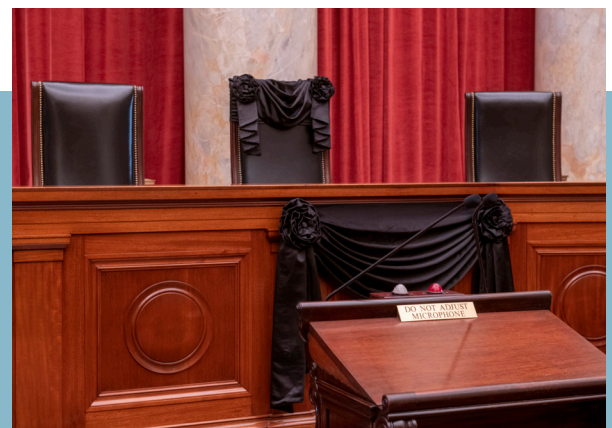
The Courtroom Bench draped for Justice Ruth Bader Ginsburg, 2020