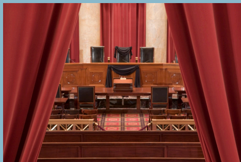
The Courtroom Bench draped for Chief Justice William H. Rehnquist, 2005