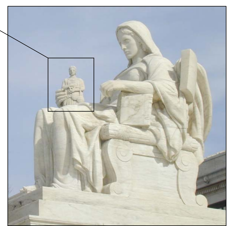
Fraser's Contemplation of Justice.

Over time, Justice became associated with scales to represent impartiality and a sword to symbolize power. During the 16th century, Justice was often portrayed with a blindfold. The origin of the blindfold is unclear, but it seems to have been added to indicate the ignorance to, or perhaps tolerance of, abuse of the law by the judicial system. Today, the blindfold is generally accepted as a symbol of impartiality.