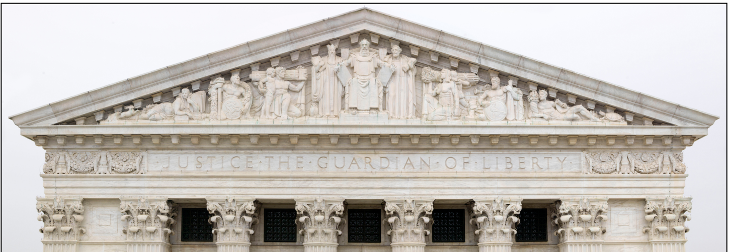
The East Pediment by Hermon A. MacNeil

“Law as an element of civilization was normally and naturally derived or inherited in this country from former civilizations. The ‘Eastern Pediment’ of the Supreme Court Building suggests therefore the treatment of such fundamental laws and precepts as are derived from the East. Moses, Confucius and Solon are chosen as representing three great civilizations and form the central group of this Pediment. Flanking this central group—left—is the symbolical figure bearing the means of enforcing the law. On the right a group tempering justice with mercy, allegorically treated. The ‘Youth’ is brought into both these groups to suggest the “Carrying on” of civilization through the knowledge imbibed of right and wrong. The next two figures with shields; Left - The settlement of disputes between states through enlightened judgment. Right —Maritime and other large functions of the Supreme Court in protection of the United States. The last figures: Left —Study and pondering of judgments. Right - A tribute to the fundamental and supreme character of this Court. Finale —The fable of the Tortoise and the Hare.”