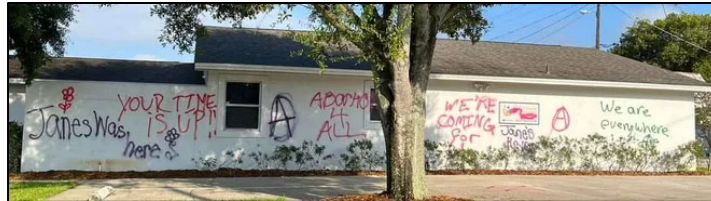
PRC in Hialeah, FL (July 3, 2022)

UP!!,” “WE’RE COMING for U,” “We are everywhere.” 88