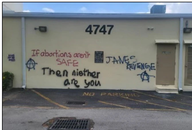
PRC in Hollywood, FL (May 28, 2022)