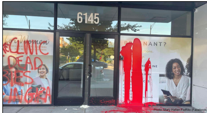
PRC in Chicago, IL (August 22, 2024)

sprayed red paint on the entrance of a PRC in Chicago, producing the appearance of blood splatter. 93