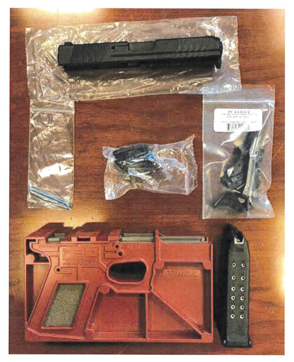
59. The other pistol case was labelled "POLYMER80 PF940v2 STANDARD BBS." It appeared to contain all components necessary to assemble a complete pistol, as well as two milling/drill bits

round magazine that was ordered, in violation of California Law at the time. Neither the frame, nor any of the component parts, included a manufacturer's serial number.