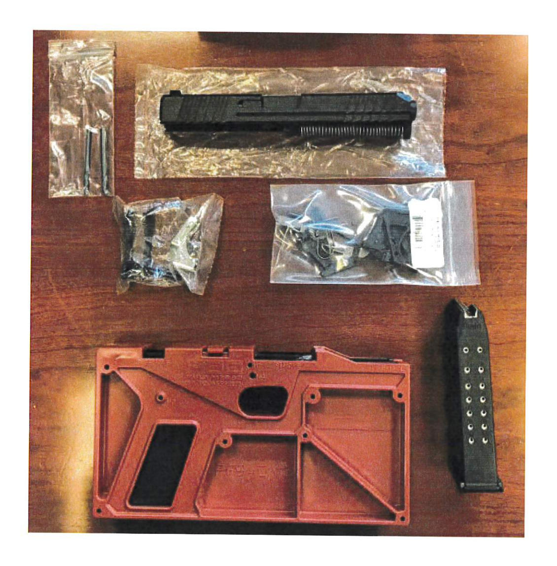
60. On April 28, 2020, SSA Hamilton, who is also an ATF Firearms and Ammunition Interstate Nexus Expert, built a

to be used in the completion of the pistol. The slide was completely assembled, including installation of the barrel and captured recoil spring. The included magazine had round count holes indicating that it has a 17-round capacity, rather than the 10-round magazine that was ordered, also in violation of California law at the time.