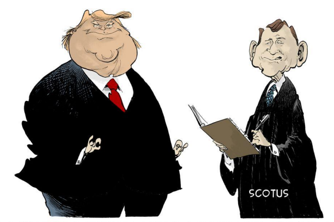
"WE'RE SCHEDULING ARGUMENTS TO DECIDE IF YOU'RE SUBJECT TO THE LAWS OF MAN, WHAT'S A GOOD TIME FOR YOU?"