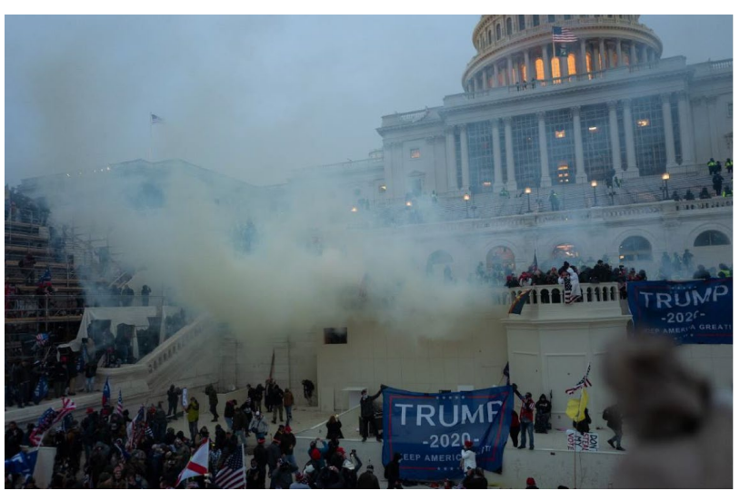
Tr. Ex. 133 at 37; Pet. App. 230a-235a; JA1327-JA1330; Tr. Exs. 15-20, 94 (videos of the attack).

In the end, reinforcements arrived from neighboring jurisdictions to put down the insurrection. JA1327. But not before over 140 law enforcement officers were injured, members of Congress and the Vice President were forced to abandon the electoral certification and flee the chambers, and the heart of America's democracy was choked in a cloud of noxious chemicals: