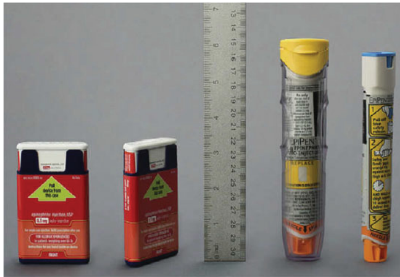
Figure 2. Visual comparison of Auvi-Q (left) and EpiPen (right).

the market. Shaped like a pen, a patient administers EpiPen by removing a cap and swinging it against the thigh, causing the needle to protrude and inject epinephrine. The patient then removes the device and a plastic shield covers the needle. After acquiring the rights to distribute EpiPen, Mylan invested substantially in marketing the product. Between 2007 and 2012, EpiPen accounted for at least 90% of epinephrine auto-injector prescriptions in the United States. Other than a few fringe competitors, EpiPen was the epinephrine auto-injector market.