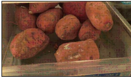
Moldy sweet potatoes

reptile house, and decomposing carcasses were left for days in the enclosures for the tigers and lions (collectively “Big Cats”). See generally PX21–22; PX27; PX73–74; PX77. General filth coated the kitchen, from the walls and sink to the refrigerator. PX75; Trial Tr. vol. 2, 101. A trashcan filled with waste stood uncovered. Id.