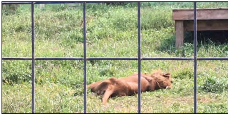
Bu on September 11, 2016, JX34