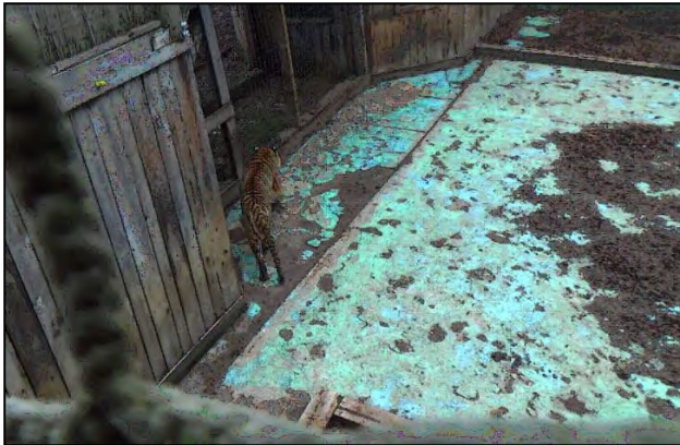
Tiger outdoor enclosure, PX33 (12/11/2014)