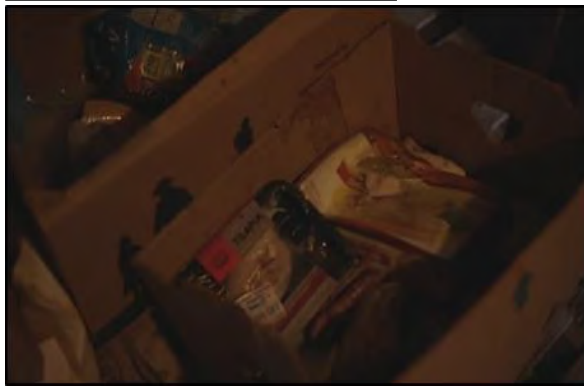
Donated food in furnace room, PX11 at 22:09 (left) and 22:31 (right) (3/3/2018)

Critically, Candy and Tri-State persisted in feeding the Big Cats dangerous spoiled food and ignored the ready availability of “[a] number of commercially prepared diets...appropriate for the varying needs for exotic or wild felids.” PX58 at 36 (USDA Animal Care Policy Manual). Nor did Tri-State ever enlist the assistance of a trained veterinarian, preferably in consultation with a