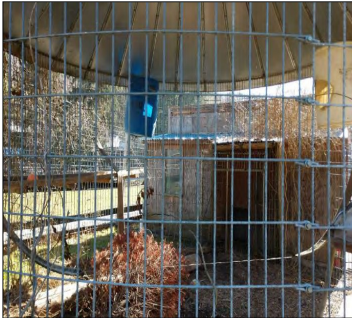
Lemur enclosure , PX12 at 12 (3/3/18)

The Madagascar habitat is complex and varied, such that lemurs have evolved to respond to and interact with its complex surroundings. PX70 at 59. For example, foraging, exploring, marking, and grooming are natural species-specific behavior developed in conjunction with their environment.