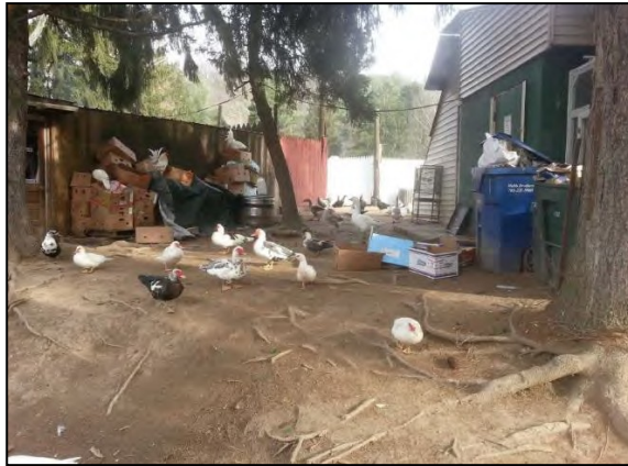
Food stored in piled boxes outside the kitchen, PX17 (3/4/2015); PX 32 (12/11/2014)

In the reptile room, just feet away from the kitchen, “decaying remnants of fruits and vegetables were scattered across the floor, and there were [] large smears of feces, presumably from the sulcatas [tortoises].” PX74 at :00–2:09, 2:27–3:50; Trial Tr. vol. 1, 78–80. Rotten scraps of vegetables and feces scattered the marmoset cage, which is stationed in the reptile room. PX77; Trial Tr. vol. 1, 92. Of the