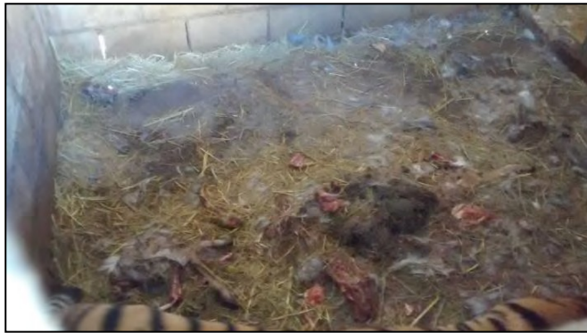
Cheyenne's indoor enclosure , PX20 (1/28/15)

The tigers' outdoor enclosures contained piles of feces, discolored water sources filled with decaying leaves, and large spots of urine residue accumulated over time. PX31; Trial Tr.vol. 1, 76; Trial Tr. vol. 4, 34.