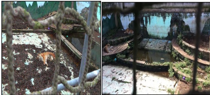
Tiger enclosure , PX24 at 1:39 (12/12/14)

The tigers' outdoor enclosures contained piles of feces, discolored water sources filled with decaying leaves, and large spots of urine residue accumulated over time. PX31; Trial Tr.vol. 1, 76; Trial Tr. vol. 4, 34.