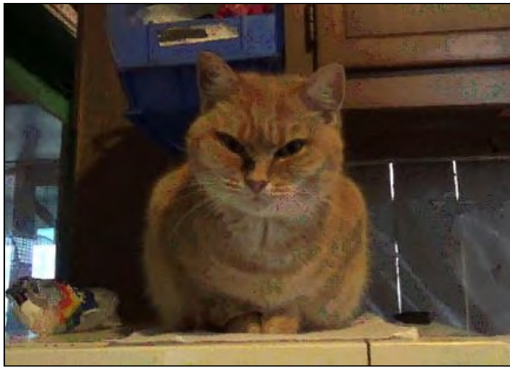
Cat in kitchen , PX25 at 27 (12/11/14)

are unvaccinated, sported matted and unkempt fur along with crusted, watery, or bloody discharge seeping from their eyes, nose, or ears. JX39, Candy 30(b)(6) Dep. 336; PX12 at 1; Trial Tr. vol. 2, 66–68, 101–102. The cat in the screenshot below, for example, had “obvious ocular discharge,” according to Dr. Haddad. Trial Tr. vol. 2, 102.