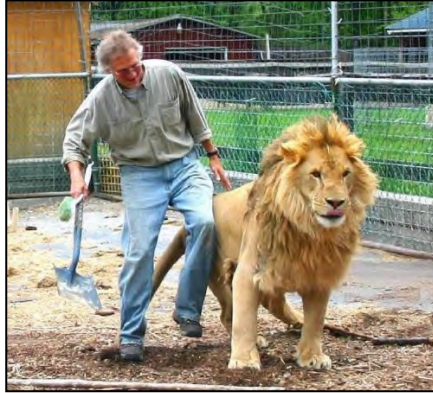
Bu, healthy, PX35