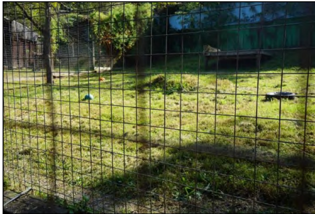
Peka's enclosure , PX85 at 115 (9/22/19)