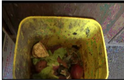
Uncovered kitchen trashcan