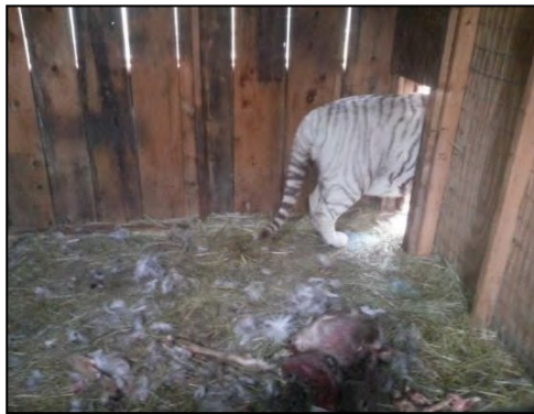
Mowgli's indoor enclosure, PX27 (12/14/14)

In the indoor tiger enclosures, tufts of fur coated rusted bars, and carcasses, bones, feathers, fur, and debris mixed with dirty straw. Trial Tr. vol. 1, 138–39, 144.