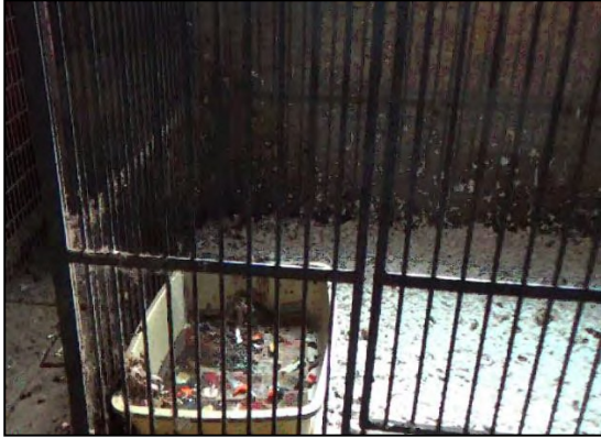
Kinkajou cage, PX45 at :53 (12/12/2014)