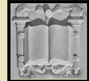
Marble metopes ( meh-toe-pees ), sculpted architectural elements, are located in the Great Hall. (Look up!)