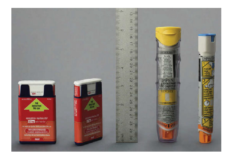
Figure 2. Visual comparison of Auvi-Q (left) and EpiPen (right).

the market. Shaped like a pen, a patient administers EpiPen by removing a cap and swinging it against the thigh, causing the needle to protract and inject epinephrine. The patient then removes the device and a plastic shield covers the needle. After acquiring the rights to distribute EpiPen, Mylan invested substantially in marketing the product. Between 2007 and 2012, EpiPen accounted for at least 90% of epinephrine auto-injector prescriptions in the United States. Other than a few fringe competitors, EpiPen was the epinephrine auto-injector market.