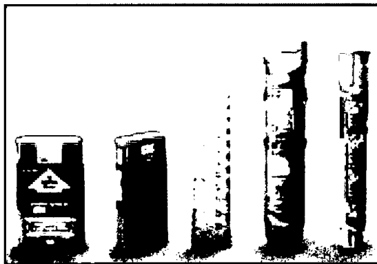
Figure 2. Visual comparison of Auvi-Q (left) and EpiPen (right).

In 2007, defendant Mylan obtained the exclusive right to market, distribute, and sell EpiPen and EpiPen Jr. Auto-Injectors (collectively “EpiPen”) in the United States. Introduced in the 1980s, EpiPen was the first epinephrine auto-injector available on the market. Shaped like a pen, a patient administers EpiPen by removing a cap and swinging it against the thigh, causing the needle to protrude and inject epinephrine. The patient then removes the device and a plastic shield covers the needle. After acquiring the rights to distribute EpiPen, Mylan invested substantially in marketing the product. Between 2007 and 2012, EpiPen accounted for at least 90% of epinephrine auto-injector prescriptions in the United States. Other than a few fringe competitors, EpiPen was the epinephrine auto-injector market.