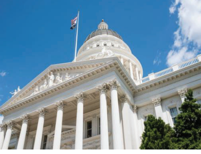
Stakeholders and Policy Makers Information