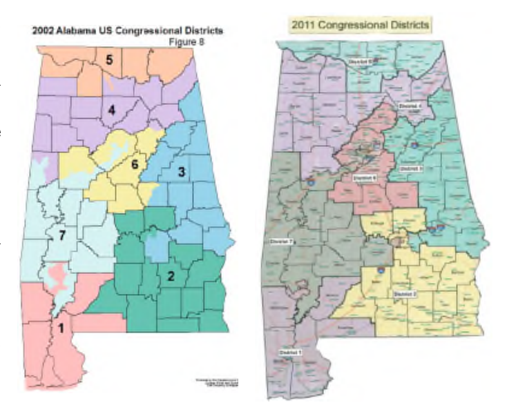
See Singleton v. Merrill, No. 2:21-cv-1291, ECF 1 at 6, 25 & ECF 15 at 9, 28.

After the 2000 and 2010 redistricting cycles, congressional districts remained largely the same. Neither the 2001 nor 2011 Maps were ever declared unlawful by a court and both were precleared by the Department of Justice. They are reproduced here.