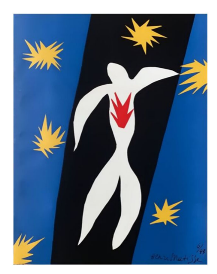
Matisse, The Fall of Icarus, 1943