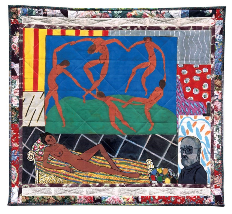
Ringgold, Matisse's Model: The French Collection Part I, 1991

As another example, Elaine Sturtevant, known professionally as Sturtevant, routinely recreated the works of other artists in different media ( e.g. , a lightly modified recreation of Roy Lichtenstein's original print "Crying Girl" as a painting entitled "Lichtenstein, Frighten Girl"):