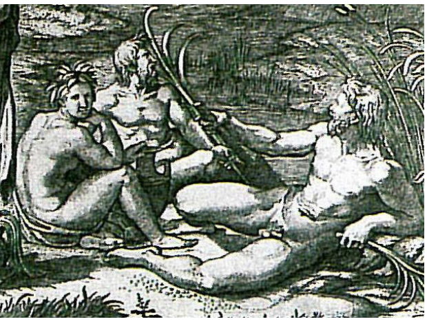
Raimondi, The Judgment of Paris

But copying is not merely a historical practice—to the contrary, it has been and remains a key vehicle for artistic expression. For example, Manet's "Le Déjeuner sur l'herbe"—one of the most famous paintings of the Western canon—imitated key elements of "The Judgment of Paris," an engraving by Marcantonio Raimondi.