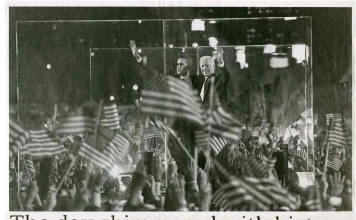
The day shimmered with history Linden, Cartoon (11/05/08, from text by Adam Nagourney, photo by Ozier Muhammad), 2008

Thomas also uses images to reflect on important historical events through his Retroflective series. The images in this series are partially obscured versions of archival photographs, modified such that at first, only the figures the artist chooses can be seen. Once a viewer looks at the image with special glasses provided to view the works, or by taking a flash photograph, the entirety of the original photograph becomes visible. For example: