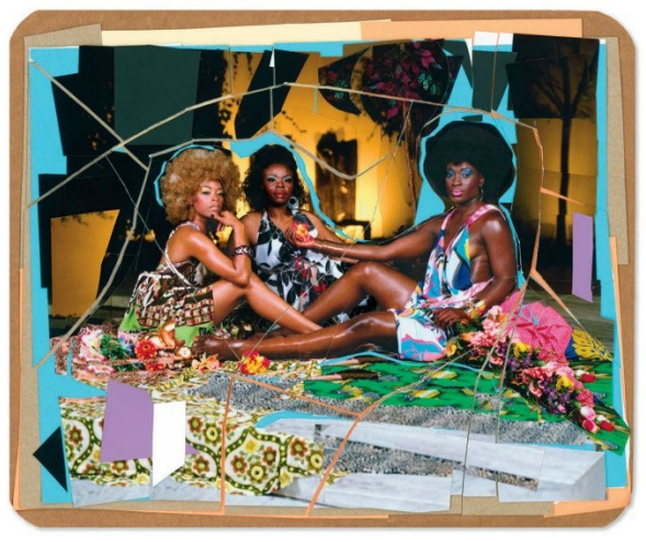
Thomas, Le Déjeuner sur L'herbe: Les Trois Femmes Noires

The fact that works such as these are immediately recognizable versions of Manet's original is integral to their power and message.