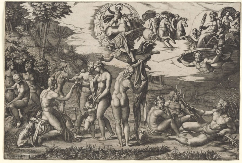
Raphael, Judgment of Paris