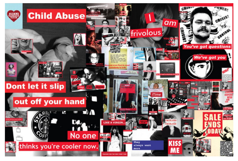
Kruger, That's the Way We Do It