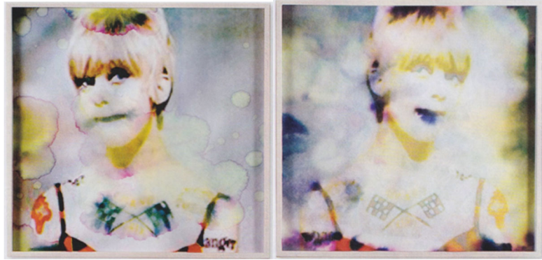
Rafferty, Goldie I and II, 2009

In a culture where celebrities are brands crafted with meticulous detail, Rafferty's works remind the viewer of celebrities' humanity by exposing the messiness that lies beneath the slick perfection of artdirected, publicist-approved photos.