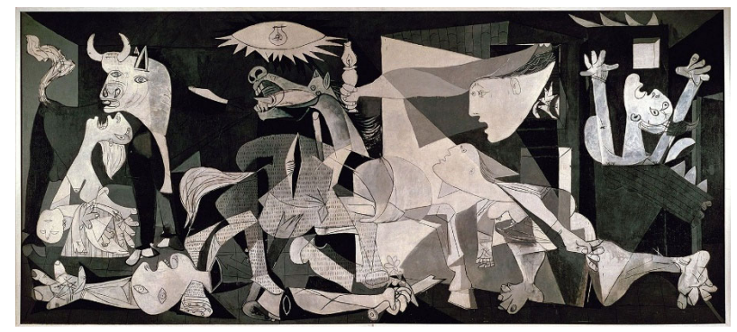
Picasso, Guernica, 1937