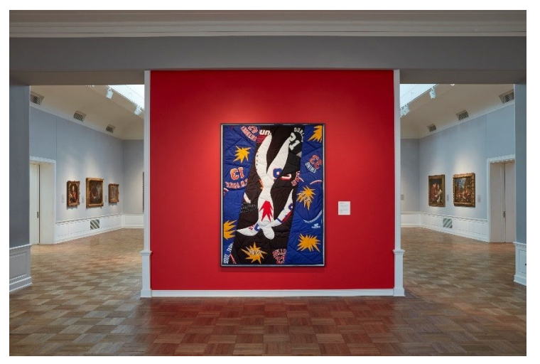
Hank Willis Thomas, The Fall of Icarus (La chute d'Icare) , 2017, mixed media including sport jerseys, 96 x 72 inches (approx.).