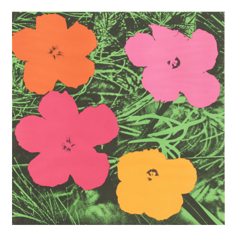
Warhol's Flowers (1964)<sup>10</sup> Off view at the Metropolitan Museum of Art

Contemporary artists continue to leverage preexisting artwork in exciting, challenging, and meaningful ways. Street artist Banksy painted a piece, Girl with a Pierced Eardrum (2017, first below), onto a building in Bristol. This in reference to Vermeer's masterpiece, Girl with a Pearl Earring (1665, second below), with Banksy's version stripped to monochrome blue with streaked and dripping paint, and an ADT alarm box in place of Vermeer's famous pearl earring.<sup>11</sup>