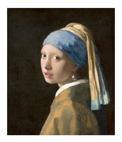
Vermeer's Girl with a Pearl Earring (1665)

These examples, mostly from amici 's collections and exhibitions, are just illustrative—and amici recognize that other submissions will likely provide this Court with numerous additional examples of artworks that borrow from preexisting works through the course of art history. For present purposes, the