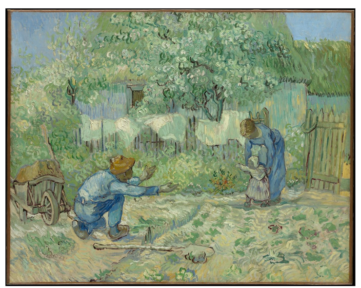
Van Gogh's First Steps, after Millet (1890) On view at the Metropolitan Museum of Art<sup>6</sup>