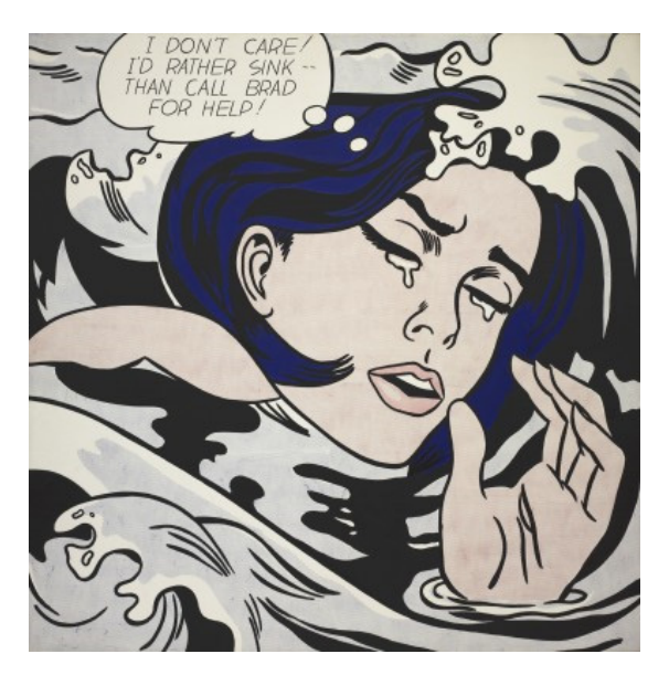
Lichtenstein's Drowning\ Girl\ (1963).