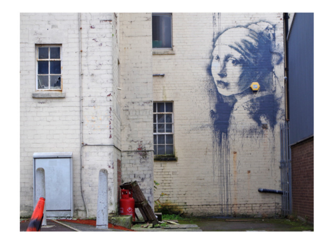
Banksy's Girl with a Pierced Eardrum (2017)