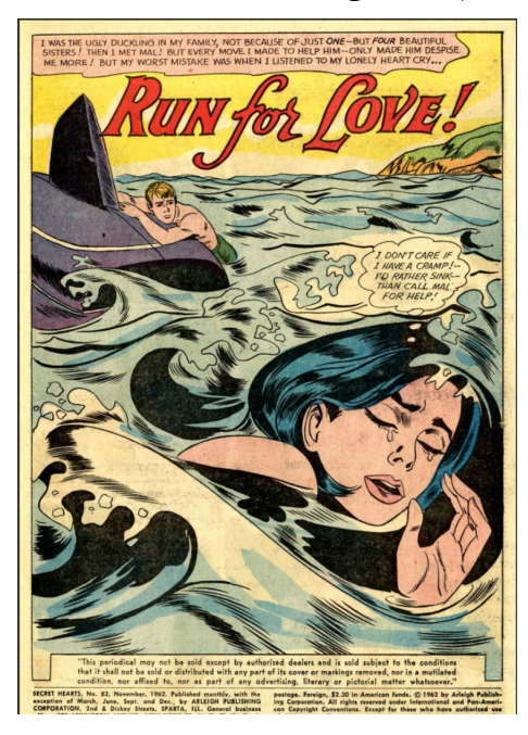
Secret\ Hearts\ \#83\ (DC\ Comics\ 1962)