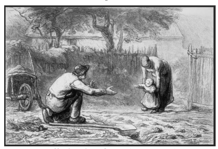
Millet's First Steps (c.1859–66)