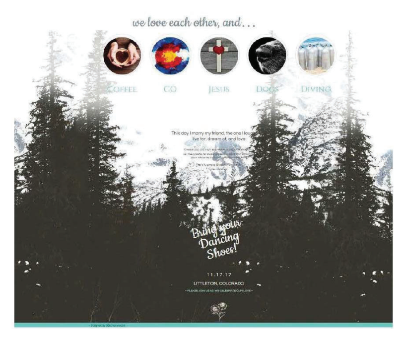
Fig. 1 – A prototype of a wedding website page design by Ms. Smith.

(Wash. 2019), cert. denied, (U.S. July 2, 2021) (No. 19-333), or even custom wedding invitations, see Brush & Nib Studio, LC v. City of Phoenix, 448 P.3d 890, 908 (Ariz. 2019). It is obvious to even the most casual viewer that Ms. Smith is creating a customized art product—which incorporates unique, expressive speech—for her customers.