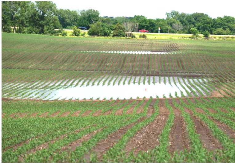
Figure 8. Small “depressional wetland” or puddle?

Even absent a definitive determination of CWA jurisdiction, the prevailing regime has had a tremendously costly chilling effect on land use in light of the vagueness of the applicable standards. Consider this photo: