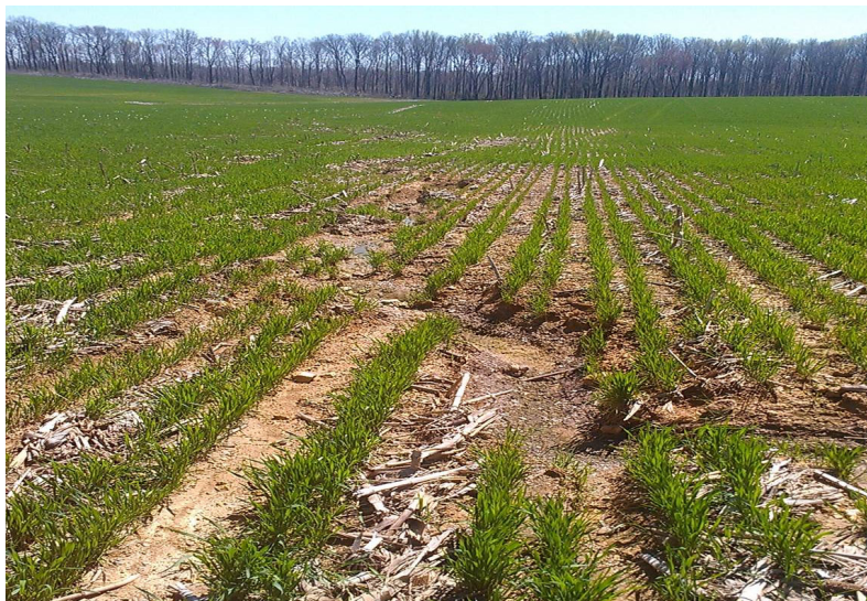
Figure 7. A ditch exhibiting an ordinary high water mark

The practical costs of the federal government's over-reaching cannot be overstated. Once a feature has been deemed a "water of the United States" subject to federal