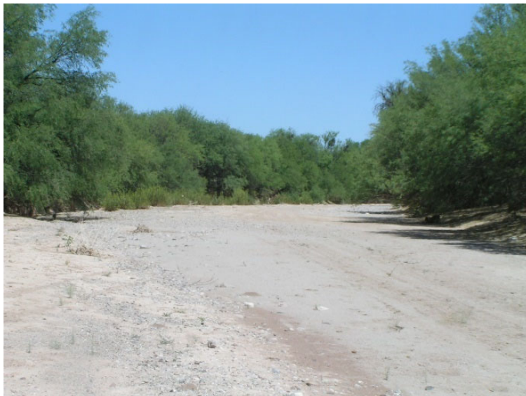
Figure 2. The San Pedro River