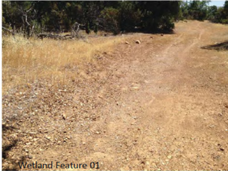
Wetland Feature 01