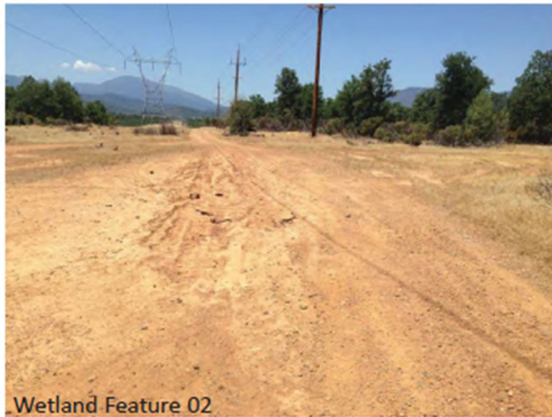
Wetland Feature 02