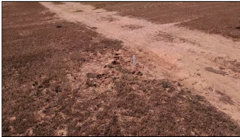
Figure 3: A small depression on a dirt road

More examples abound, illustrating just how far the federal government has strayed from the textual limitation of its jurisdiction to "waters of the United States." In recent years, the Corps has asserted jurisdiction over: