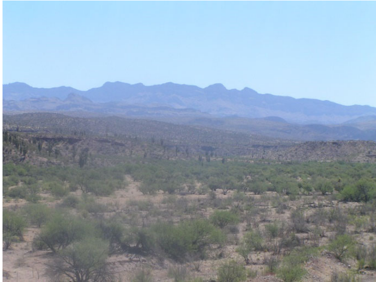
Figure 1. Redfield Canyon Wash

surface water connection to any body of water. Under the agencies' standards that have historically prevailed, it nonetheless is a "water of the United States."