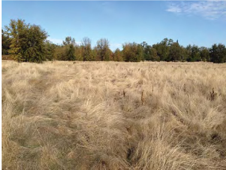
Figure 6. Pits dug to test soil percolation