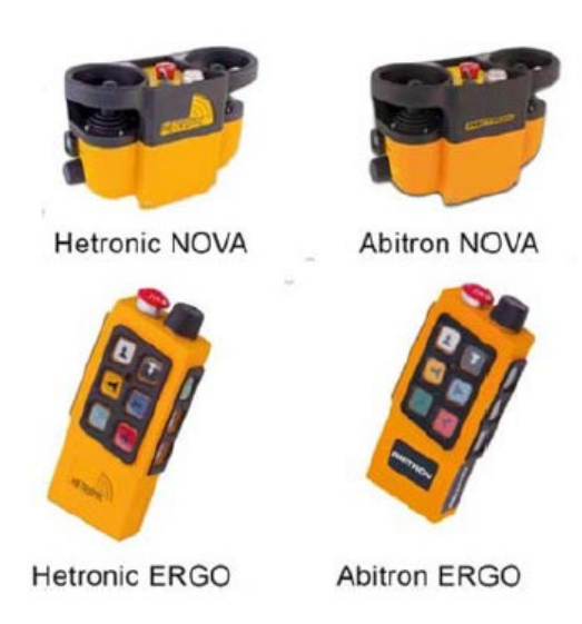
Id. at 1644. Before this litigation ensued, they sold several hundred thousand dollars' worth of products in the United States.