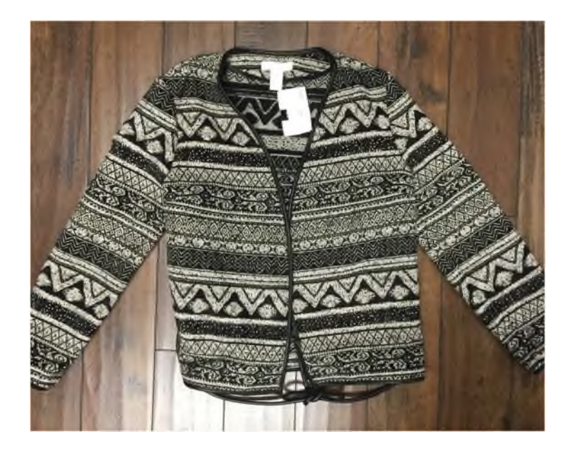
EXHIBIT 37 Physical Exemplar Introduced at Trial (Will Be Submitted Upon Request)