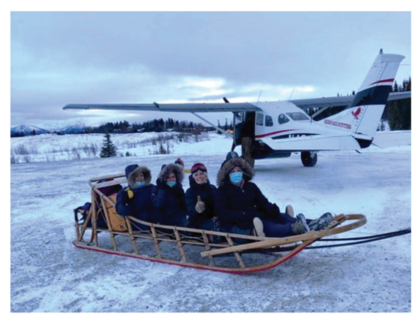
Photo 1 - A team of vaccinators sit in a sled next to their chartered plane before being pulled behind a snow machine into the village of Shungnak in Dec. 2020.

the Alaska Native people and entities in exercising self-determination.