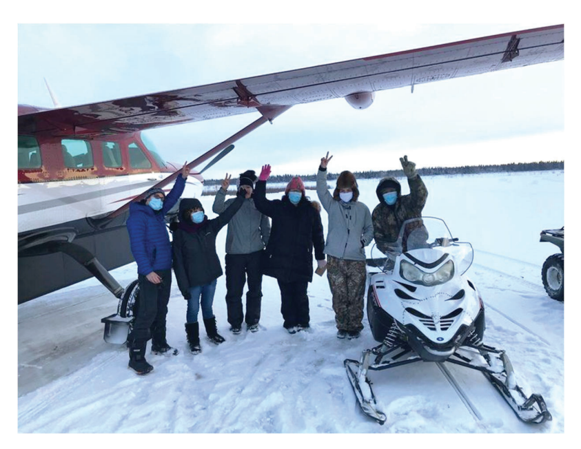
Photo 3 - By snow machine, bush plane, and ATV, vaccines are getting in remote regions of Alaska.