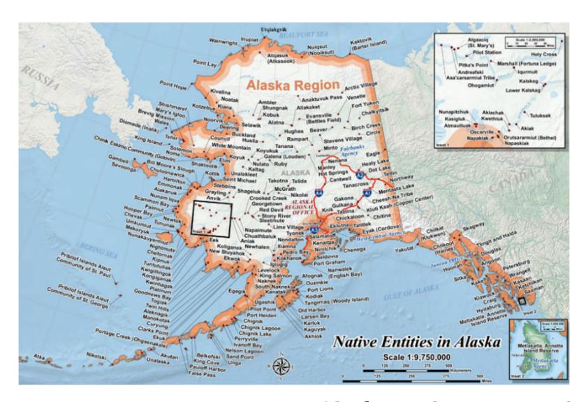
Map 1 - Native Entities in Alaska and Major Road System. The smaller inlaid box represents the only Alaska Native community, Metlakatla, that opted for a reservation system. Metlakatla is under the jurisdiction of the Northwest BIA division, not the Alaska division, because it operates more like a Lower 48 List Act tribe.