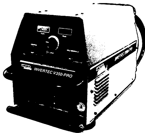
INVERTEC V 350 -PRO without attachment (V-350)