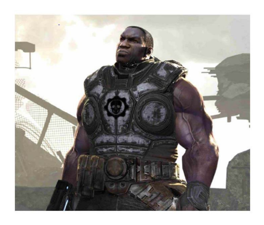
28a Appendix B

Plaintiff's Statement of Undisputed Material Facts \P 9.