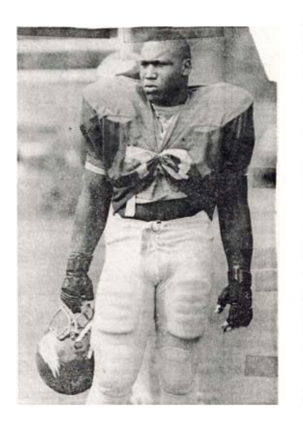
29a Appendix C