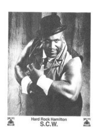
30a Appendix D