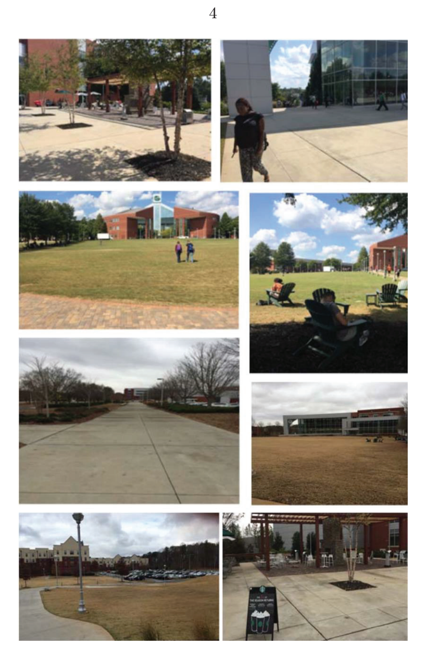
\mathit{Ibid}.; First Am. V. Compl. Exs. 7A–7F.