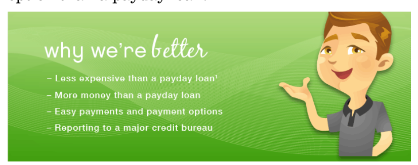
Id. 119a, ¶22.

The website proclaimed that the loan was a better option than a payday loan: