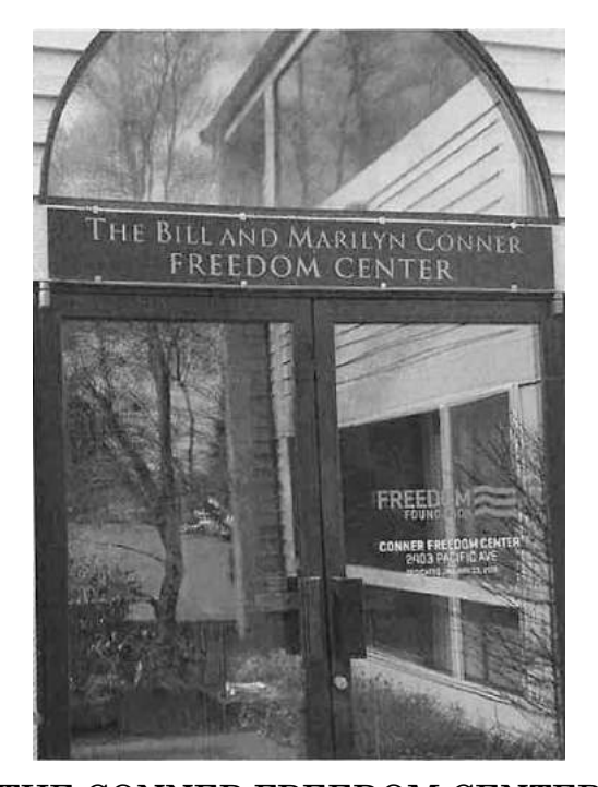
THE CONNER FREEDOM CENTER