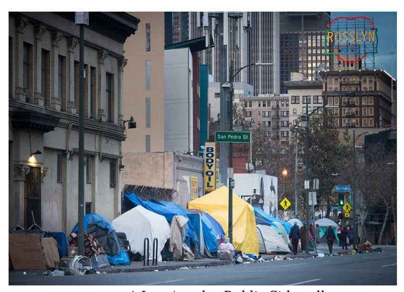
A Los Angeles Public Sidewalk

equipped with mini refrigerators, cupboards, televisions, and heaters, [that] vie with pedestrian traffic" and "human waste appearing on sidewalks and at local playgrounds." <sup>16</sup>