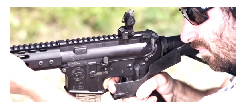
Photograph Two: Trigger comes into contact with stationary index finger.

Photograph One: Trigger separates from stationary index finger.