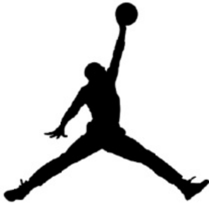
Nike's Jumpman logo