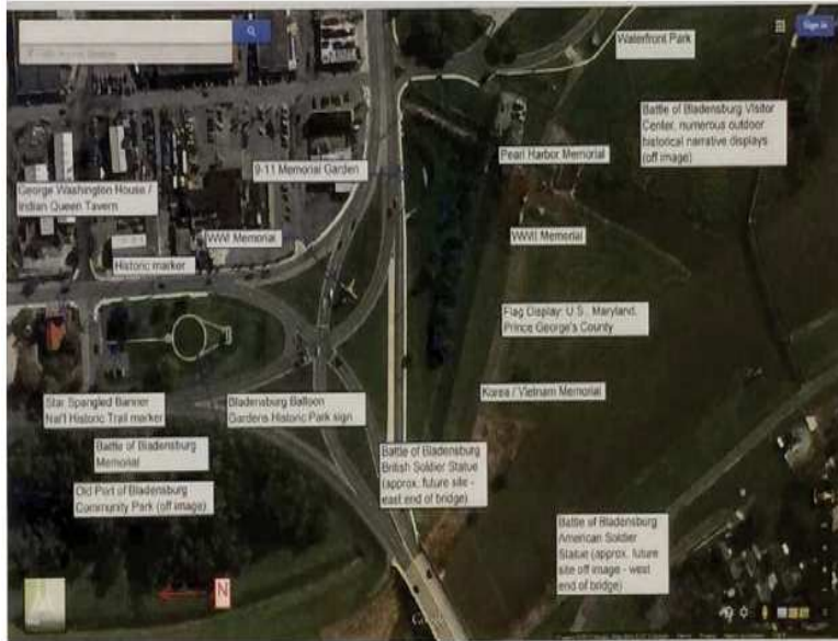
(Supp. J.A. 2) 23