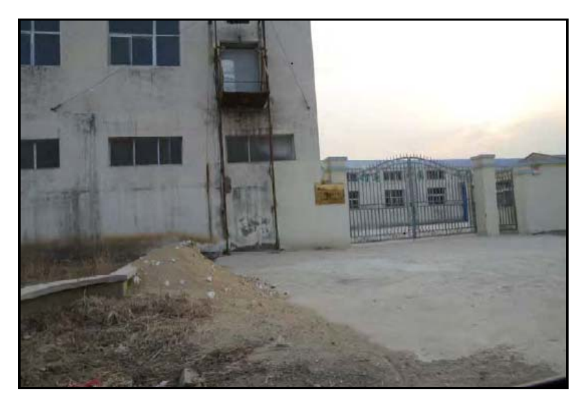
The Agritech factory in Bengbu, Anhui, January 2011

The Beijing plant is larger, but plant staff said in our presence that the facility was idle. The company would not allow us in, but we drove around the plant and saw a few people on site washing clothes but no evidence of production. Local government officials said that Agritech had not been able to obtain a production license for granular fertilizer and that it produced a very small volume of liquid fertilizer.