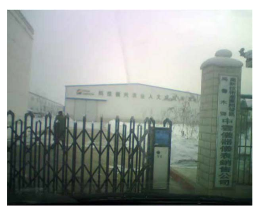
The facility outside of Urumqi, which is idle, has Agritech's name but also the names of two other factories.

In Anhui, which Agritech calls its principal production facility, $400,000 worth of plant and equipment would seem slim for 100,000 tons of production capacity. We visited and found a small plant on a rutted road outside Bengbu, completely deserted.