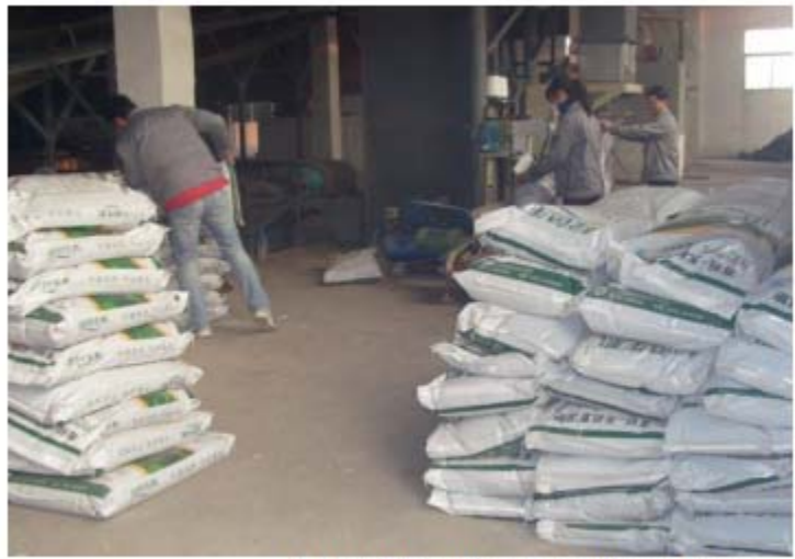
Anhui Facility Loading Area