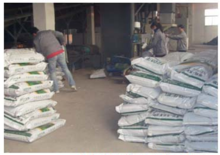
Anhui Facility Loading Area

These workers are amazingly strong. They move 2.5 million bags of fertilizer with nary a fork-lift.