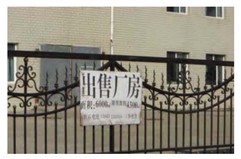
"For Sale" sign on CAGC's factory in Heilongjiang. Photo taken in Fall 2010.

No contract with Sinochem: A January Agritech announcement states: "In May 2010, the Company signed a renewed contract supplying organic liquid compound fertilizers to Sinochem, China's largest fertilizer distributor. The sales contract is worth RMB 61 million (approximately $9 million) and the Company will also continue to supply Sinochem with organic granular compound fertilizer under another existing contract." But a manager with Sinochem told us that Sinochem has no contract with Agritech and in fact has never bought or sold organic liquid fertilizers.