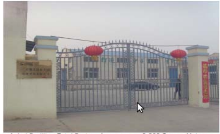
Anhui Facility—Total Factory Area approx. 8,000 Square Meters

Firstly China Agritech claim all their production facilities are working normally and give a few addresses. (The addresses differ from the addresses in the 10K-a new complication.) They also give some photos. Here are the photos given of the Anhui facility.