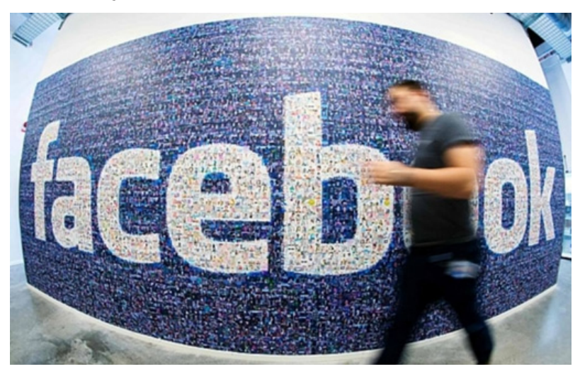
Ordem foi dada pela justiça em fevereiro de 2016; Facebook teria descumprido