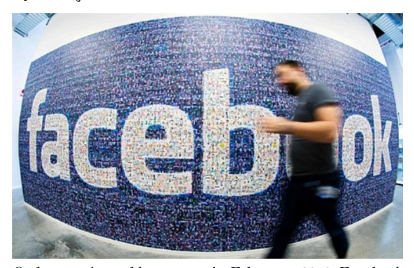
Order was issued by a court in February 2016; Facebook is alleged to have failed to comply