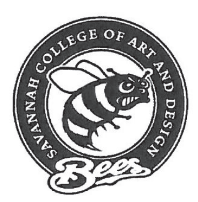
Id. ¶ 9. SCAD registered each of those marks with the U.S. Patent and Trademark Office for inclusion on the principal register, based on its use of the marks in connection with the provision of educational services. Id. ¶¶ 8-13.

SCAD does not limit the use of its marks to educational services. SCAD also uses the marks in connection with its varsity athletic programs in golf, tennis, lacrosse, soccer, swimming, fishing, and other sports. In addition, contrary to the assertions in Sportswear's petition, SCAD has long made apparel featuring the marks available for sale to students and the general public—just as the vast majority of colleges and universities do. See Compl. ¶ 19. The parties dispute when SCAD first began selling apparel with SCAD marks, but SCAD has presented evidence that it has sold such apparel since at least 2008—before Sportswear began selling its knock-off