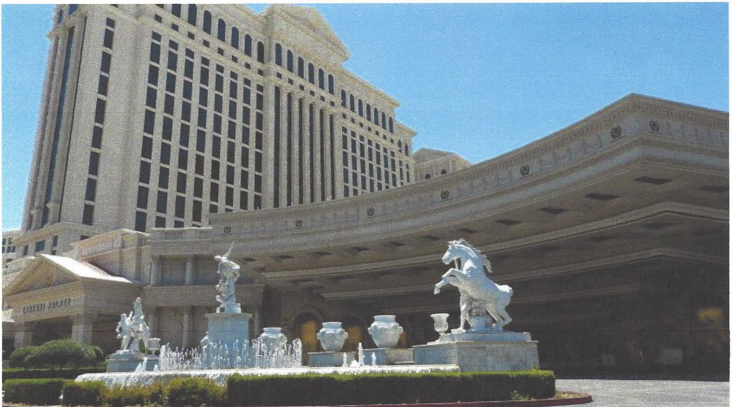
Caesars Palace is expected to reopen June 4. (Jay Jones)